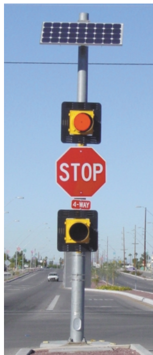
24-hour solar-powered flasher featured on the cover of IMSA Journal , May/June 2004