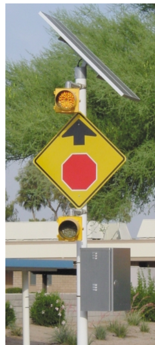
Scottsdale Airpark, AZ